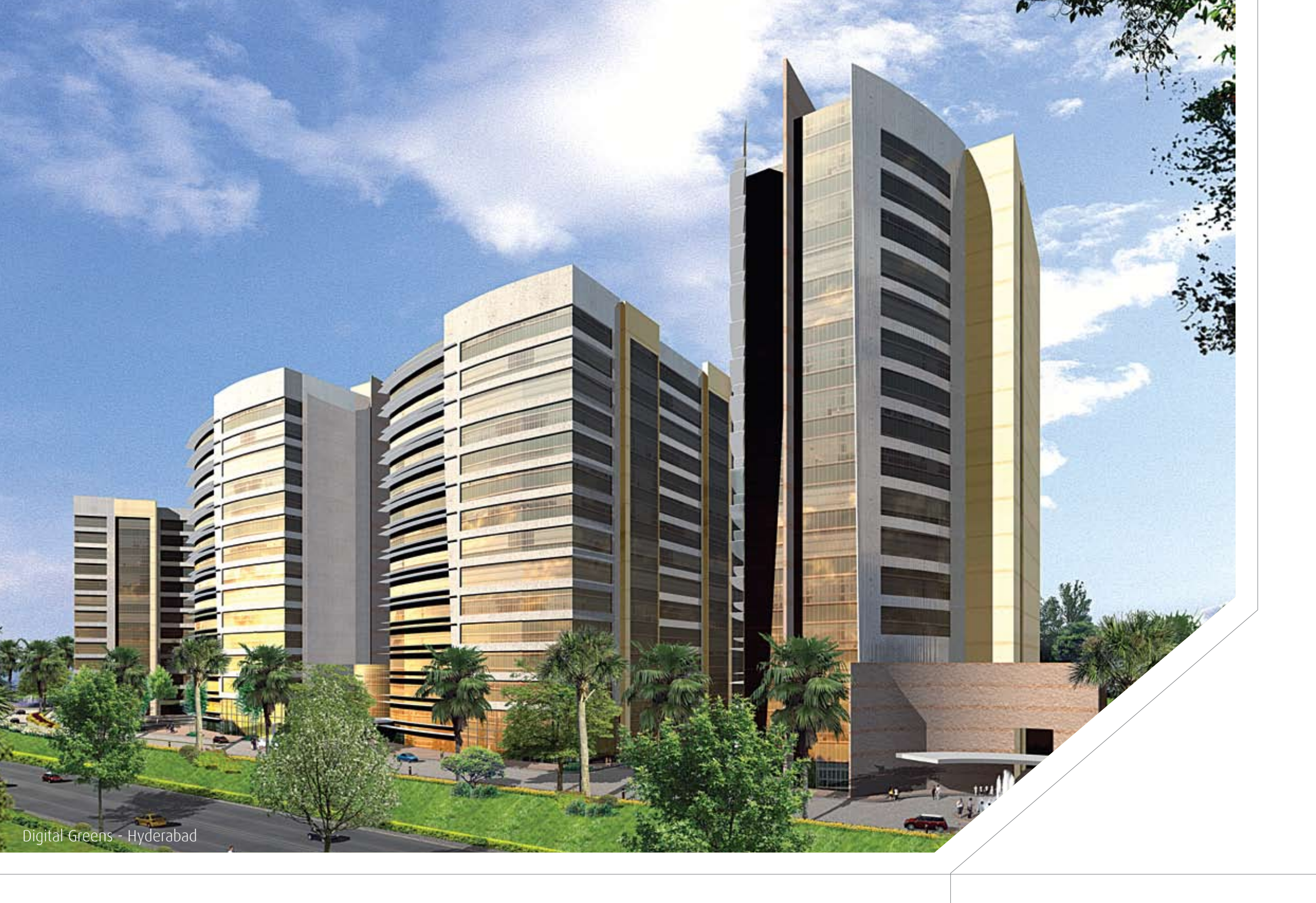
Digital Greens - a concept for the future