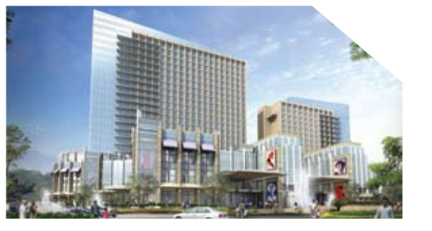
JW Marriott - Kolkata