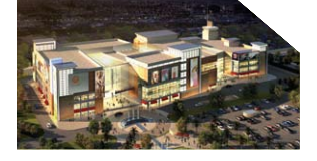
The Mall of West Delhi - Delhi