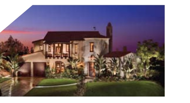
John Laing Homes

With it's roots in the UAE, Emaar has developed significant portions of Dubai and built many flourishing communities featuring luxurious lifestyle options. Currently under development, the Burj Dubai will be the world's tallest tower and the centrepiece of the Gulf region's most prestigious urban development to date. This architectural phenomenon will be a global tourist magnet, skyrocketing Dubai into the global limelight. With Joint ventures and projects in India, Saudi Arabia, Syria, Morocco, Egypt, Tunisia and Turkey, Emaar is taking its winning formula, first conceived in its home base Dubai, to the rest of the world.